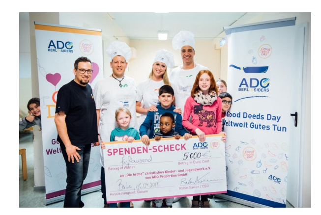
Event for the Children of the Berlin-Based Arche Charity ADO Properties, Germany