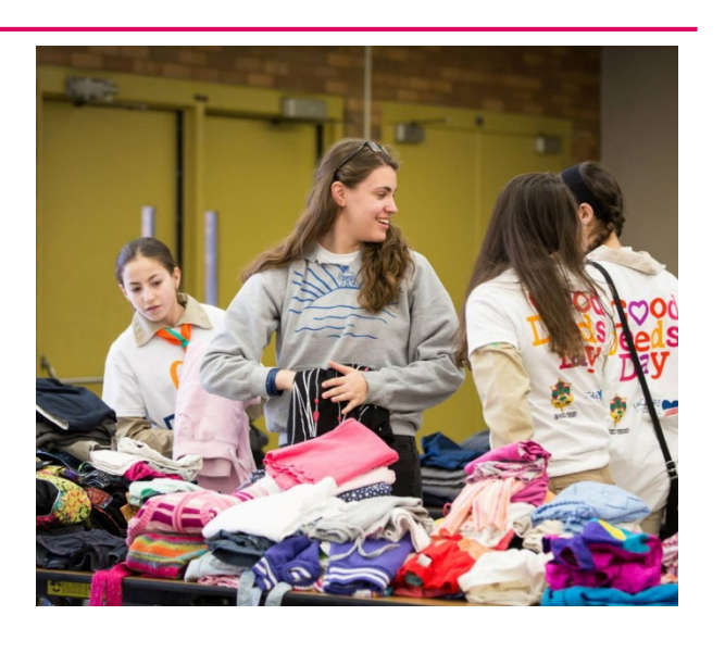
Organize a 'Give & Take' market