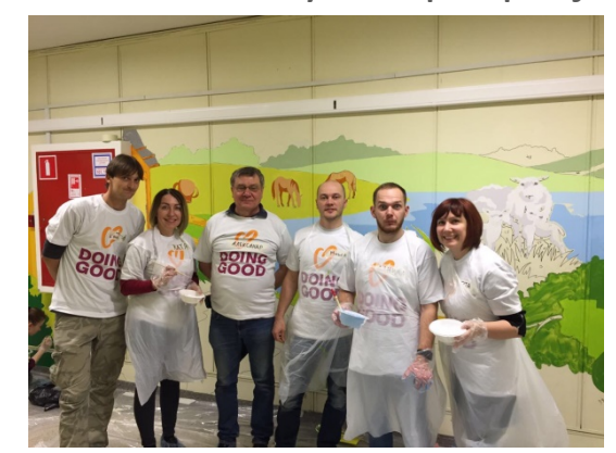
Painting a wall mural Gilat Satelite Networks, Russia

Good Deeds Day sample projects by companies around the world: