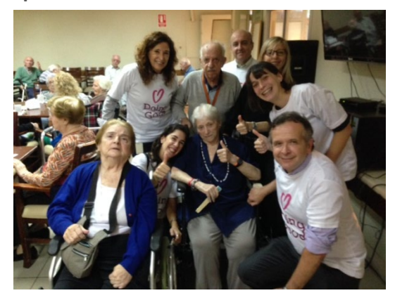
Arts and Crafts with the elderly BHI, Uruguay