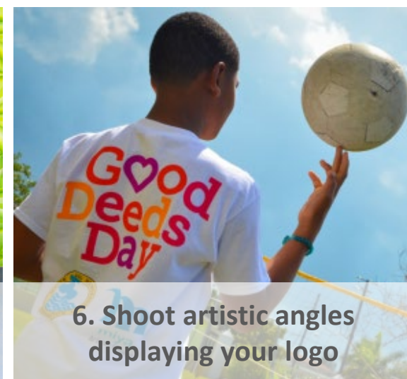
6. Shoot artistic angles displaying your logo