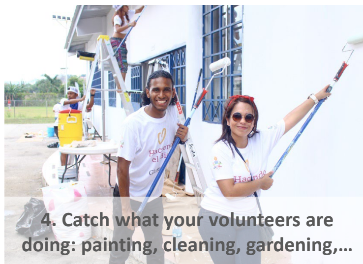
4. Catch what your volunteers are doing: painting, cleaning, gardening,...