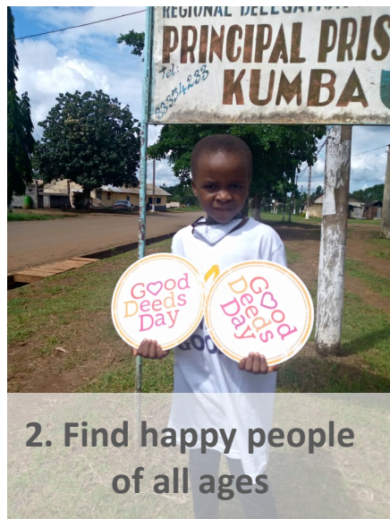
2. Find happy people of all ages