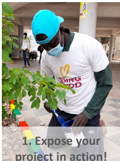
1. Expose your project in action!