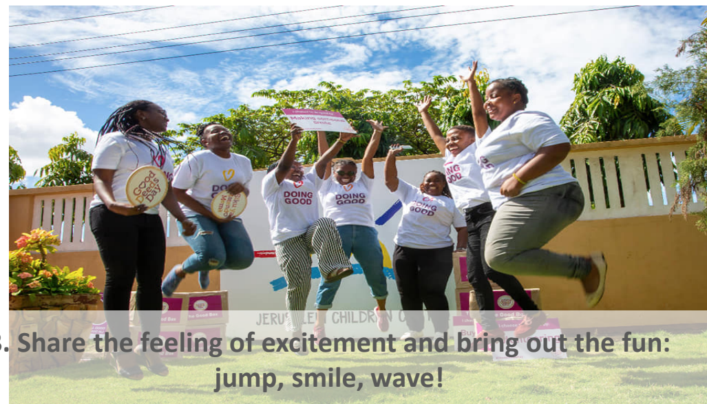
3. Share the feeling of excitement and bring out the fun: jump, smile, wave!