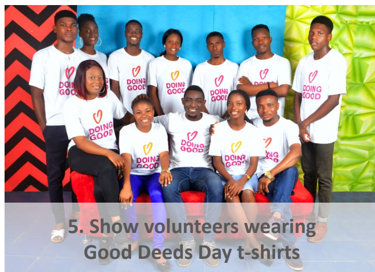
5. Show volunteers wearing Good Deeds Day t-shirts